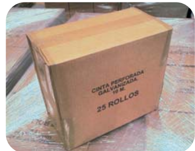
1.000 rolls in pallet