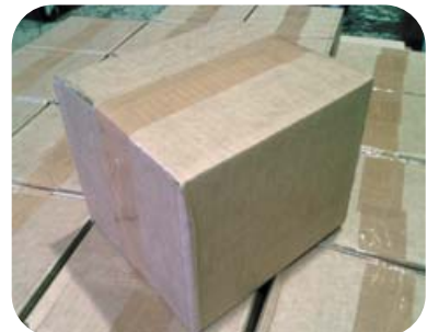
1.120 rolls in pallet